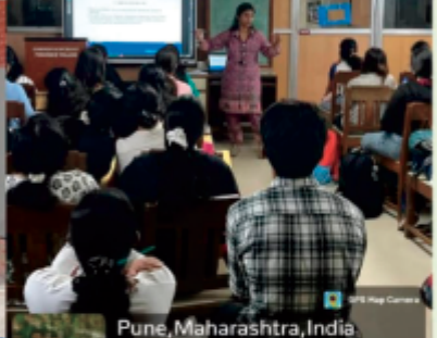
Pune, Maharashtra, India Fergusson College Road, Deccan Gymkhana.